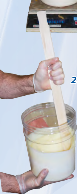
2. Mix Thoroughly.