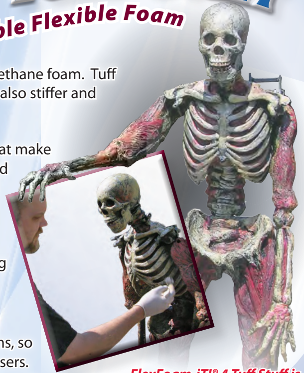
FlexFoam-iT!® 4 Tuff Stuff is ideal for animatronic Halloween displays.

FlexFoam-iT!® 4 Tuff Stuff is faster than our other foams, so we recommend this product to only experienced users. At room temperature, you have about 25 seconds to mix and pour. This foam starts to rise almost as soon as you start mixing Part A + Part B. Mixture expands about 10 times its original volume depending on mass and mold configuration. Tack free time is about 20 minutes.