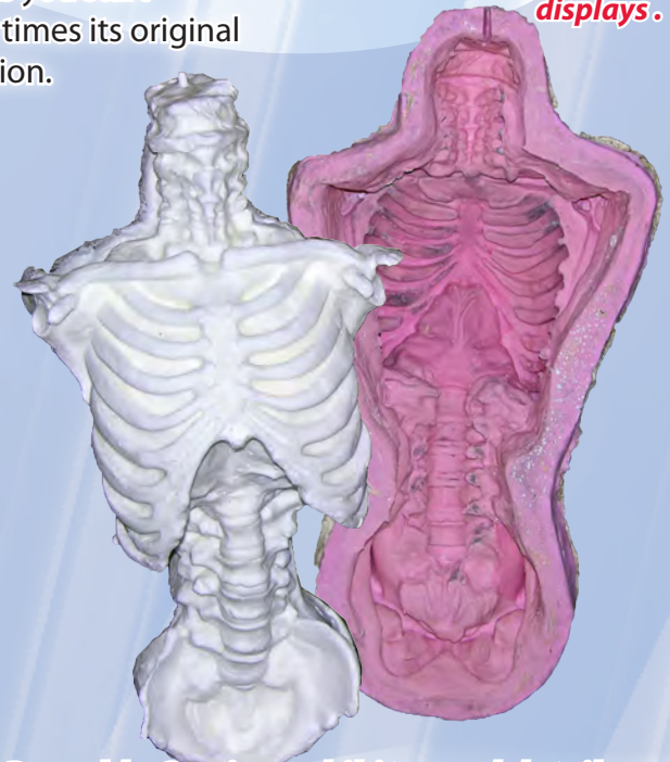
4. Demold - Casting exhibits good detail, is lightweight and durable.